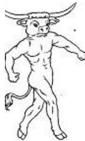
"cattle mind" Dominant people

People with Cattle dominant mind live with their physical labour. They produce Primary product. (Like farm products, Handicrafts, Driving Carts and working as industry labourer. They are always poor. Many of them live on the boarder of existance.