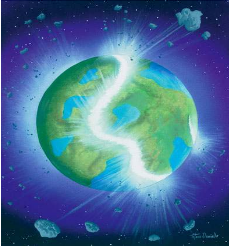
Fig. 5.0 The breaking up of the fountains of the Great Deep (Gen. 7.11)