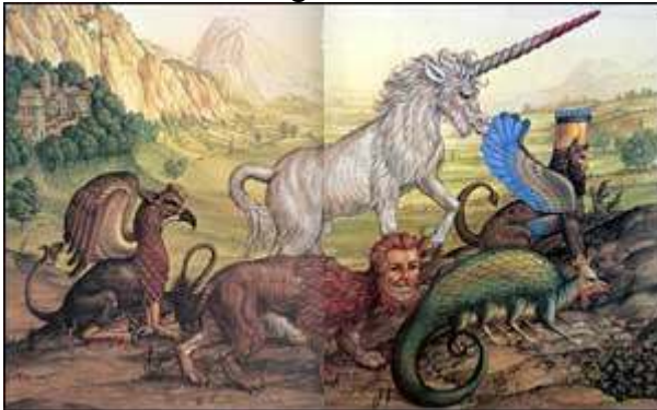
Fig. 1.0

Below I have taken some illustrations from which it can possibly illustrate the look of mutated human beings with demons as fathers.