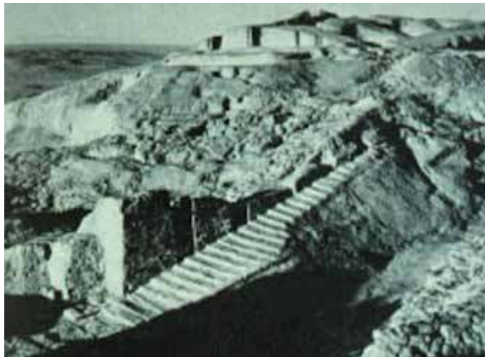
Fig. 3.0 This temple was erected at Warka or Uruk (Sumer), probably about 300 B.C. It stood on a brick terrace, formed by the construction of successive buildings on the site (the Ziggurat). (from: http://www.crystalinks.com/sumerart.html )

(from: http://www.crystalinks.com/sumerart.html )