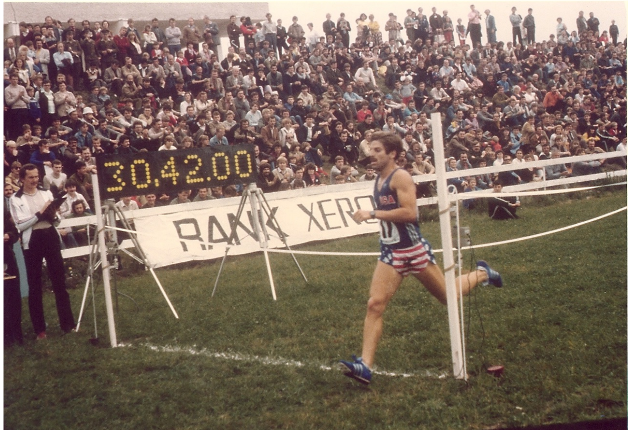
1981 World Championships-Running event