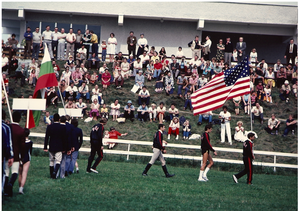
1981 World Championships-Opening Ceremony carrying the U.S. flag