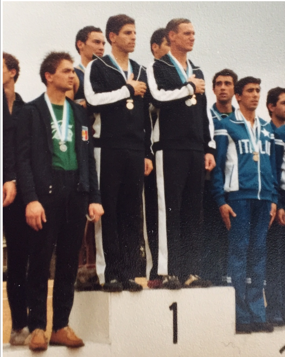
1979 Military World Championships-Gold medal and an hour later our Coach came into