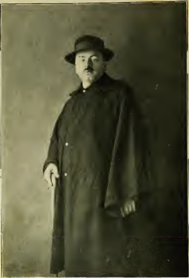
DR. ALFRED ADLER "THE NEUROTIC CONSTITUTION"