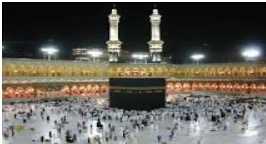
Kaaba in Mecca 1

The Allah of Islam is worshipped at the Kaaba. The Muslims must visit the Kaaba at least once in a lifetime. The Muslims claim that the Kaaba was the first House of Worship, and that it was built or re-built by Abraham and Ishmael on God's instructions.