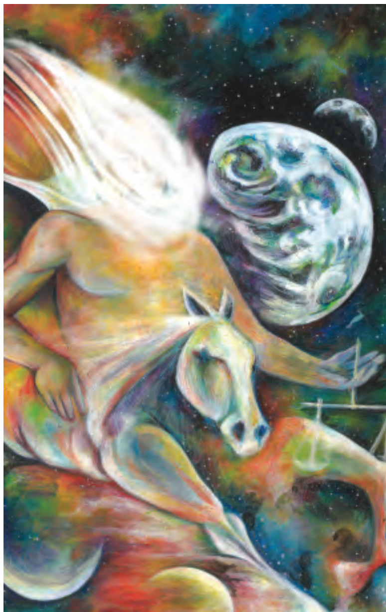
Babaji Archangel Michael