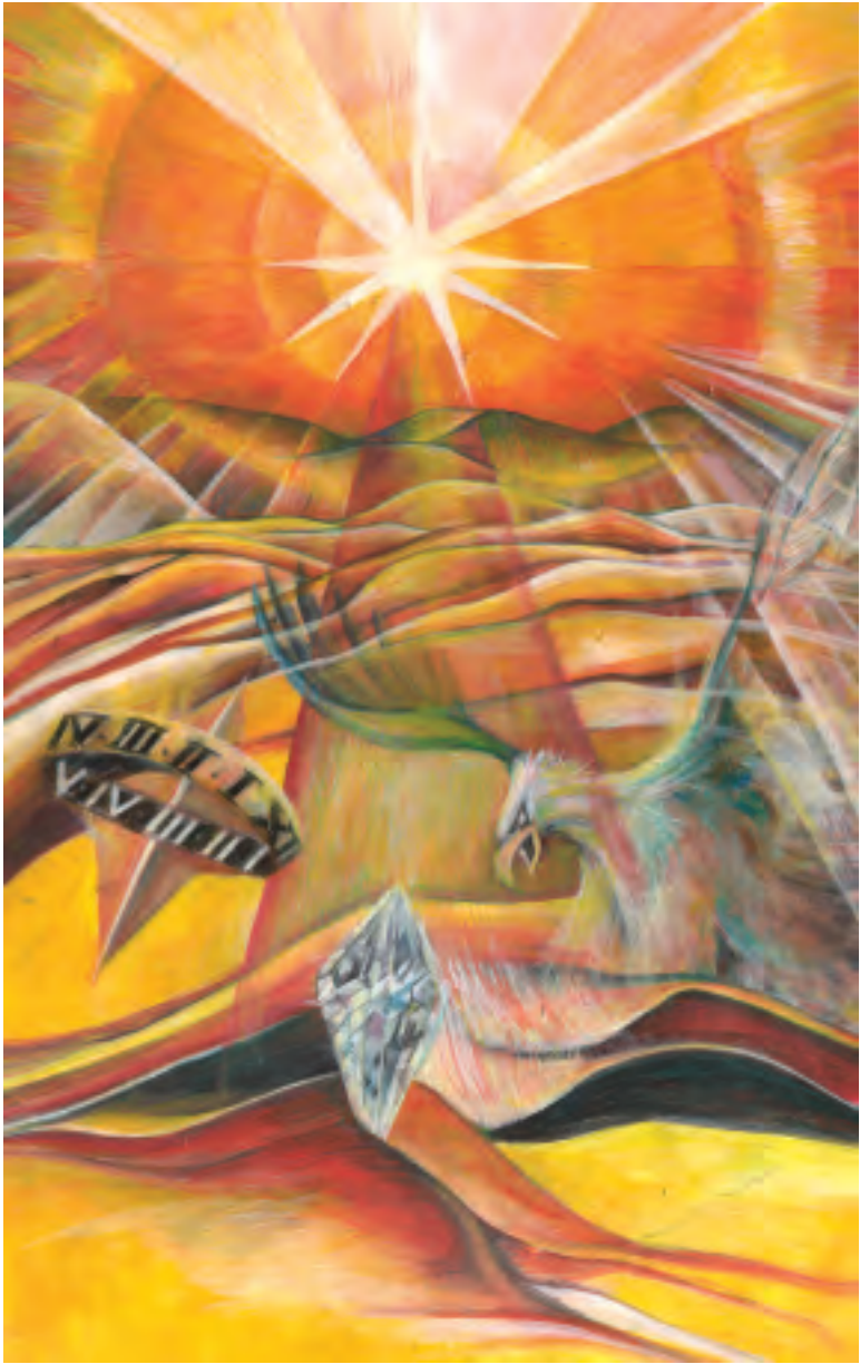
Sand Storm and Sundial