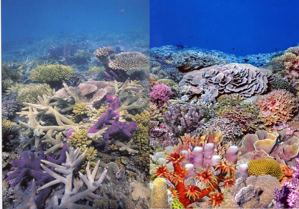
Fig. 5-6. Shows the various colorful corals that can be seen underwater in tropical places such as the Philippines. Most of the corals are distributed in the tropical belts because of the requirement of the dinoflagellate algal symbionts for Sun light.

Let us probe a little deeper. How about the atmosphere of the earth? Our earth's atmosphere is made of primarily three gases, Nitrogen (78%), followed by Oxygen (21%) and then the inert gases (Argon-0.93%, Carbon dioxide-0.038%). Below I have taken an illustration of this atmospheric composition (Fig. 7.), and you can see that Nitrogen is the most abundant gas composition of the atmosphere. Until now there is no plausible explanation for why would there be a largely maintained Nitrogen gas in the atmosphere. But practically and biblically, we need this Nitrogen component of the atmosphere because without it, combustion or the process of burning would be unretarded making it very easy for us to burn down a house, a farm, a building as well as Oxygen can consume our skin too. Too much of a good thing can really hurt; when Oxygen gets the upper hand, it can form free radicals which can easily become incorporated in our bodies and in no time we are dead because of this. The Oxygen molecules are aggressive and that is why they are also called radicals. This can be observed in nature in how it can consume an exposed iron metal. The rusting of house roofs as well as iron fences and structures would be very fast. The Creator placed Nitrogen to control this reactivity of the Oxygen gas.