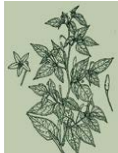
Cayenne - Capsicum annum

When many people think of cayenne they think of burning pain. Of course, in high doses this is true. However in small amounts cayenne can actually have a relieving effect on pain and has traditionally been used to treat stomach ulcers due to antimicrobial properties. In the digestive system cayenne is also useful for improving digestion and absorption of nutrients.