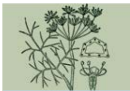
Fennel Seed - Foeniculum vulgare

For centuries the seeds have been utilized to stimulate appetite and as a digestive aid to help with flatulence and indigestion. Fennel seeds often provide quick and effective relief from many digestive disturbances. They help to overcome gas, cramps, acid indigestion, and many other digestive tract maladies. They soothe the detoxification process.