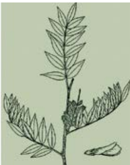
Licorice Root - Glycyrrhiza glabra