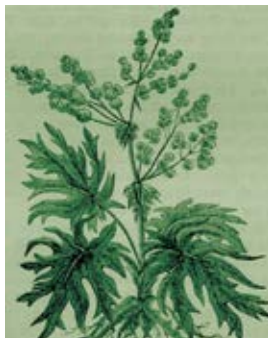
Turkish Rhubarb - Rheum palmatum

The root of Turkish rhubarb has been used traditionally to improve both digestion and loss of appetite. Rich in tannins that increase the flow of saliva and gastric secretions, it can be used as an astringent or stomach tonic at a low dosage to stop diarrhea. In army camps it was said to stop the deadly scourge of dysentery.