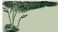
Kelp - Macrocystis pyrifera

Kelp is included as another super-food. It is a complete multi-mineral provider and helps balance energy levels and sugar cravings. It has the added benefit of boosting metabolism by supplying the thyroid with iodine.