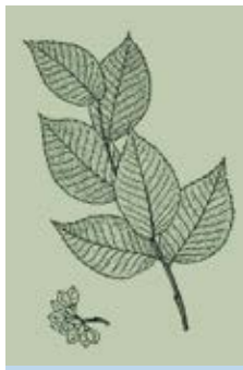
Slippery Elm - Ulmus rubra