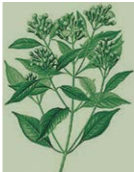
Cloves - Syzygium aromaticum

In China it is reported that cloves were taken over the centuries for diarrhea, most liver, stomach and bowel ailments, and as a stimulant for the nerves. Cloves have been used to treat flatulence, nausea and vomiting. In tropical Asia cloves have been given to treat malaria, cholera, tuberculosis and scabies. Traditional uses in America include treating worms, viruses, candida and various bacterial and protozoan infections.