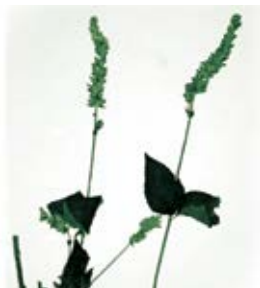
Chia Seed - Salvia hispanica

The high soluble fiber content in the seeds creates a gel in the intestine. The beneficial effects of these prebiotic soluble fibers (short chain carbohydrates) are fairly well known. Less well known are the healing effects of these fibers, which encourage the growth of beneficial bacteria and inhibit the growth of harmful bacteria. They do this largely by lowering the pH. Apart from improving digestive health, scientific research indicates that