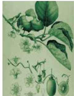
Kiwifruit - Actinidia chinensis

Research shows that kiwifruit is able to boost the natural defenses of the body, improve muscle performance and digestive health, plus reduce cell damage and inflammation. Kiwifruit is rich in the enzyme actinidin, is high in vitamin C and carotenoids, including beta-carotene, lutein and zeaxanthin. One study suggests that kiwifruit can increase the body's natural response triggers that are associated with conditions such as diabetes, arthritis, obesity, heart disease, and cancer. It truly is a powerful antioxidant-rich superfood.