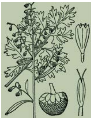
Wormwood - Artemisia absinthium

It stimulates peristalsis. Wormwood is excellent for those with sluggish digestion, toxins and congestion in the bowel, liver problems and a general feeling of being run down. Well known for killing worms.