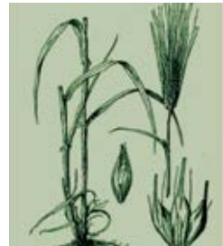
Barley Grass - Hordeum vulgare

Barley grass has one of the highest natural levels of the enzyme SOD (superoxide dismutase), which is a powerful antioxidant and anti-inflammatory agent supporting liver detoxification. It is rich in vitamins and minerals and is classed a super-food. Barley grass is alkalizing and is high in chlorophyll.