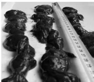
From a client at one of our Detox retreat centers.

Not everybody achieves this amount of clearance, but 10-25 pounds (5-12kg) is the average result in the first 10 days. You can imagine the wonderful clear feeling you gain by removing this, including reductions in the following: acne, allergies, arthritis, asthma, back pain, bloating, boils, candida, cholesterol, constipation, eczema, fatigue, intestinal gas, gout, headaches, heartburn, high