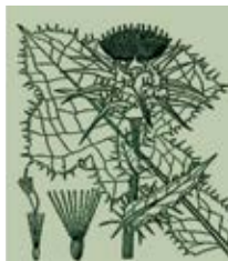
Milk Thistle - Silybum marianum