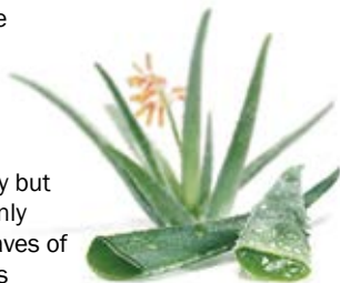
Aloe Vera - Aloe barbadensis

Aloe is used in the Herbal DETOX as a prebiotic and mild laxative with overall healing, nourishing and protecting effect on tissues.