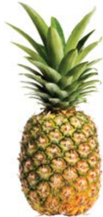
Pineapple - Ananas comosus

Pineapple has been used for centuries in Central and South America to treat indigestion and reduce inflammation. It contains the digestive enzyme complex called Bromelain. The exact chemical structure of all active components of bromelain are not yet fully understood, but its many actions include: protein digestion, reducing blood clotting, reducing inflammation and inhibiting tumor growth. Bromelain has been reported to heal gastric ulcers in scientific studies.