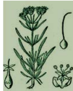
Psyllium - Plantago psyllium

Psyllium seed husk is 34% insoluble fiber and 66% soluble fiber, providing an optimal division of both types. This gives both intestinal pre-biotic and stool bulking properties. The husks act as a sponge, absorbing water and waste material in the bowels. This helps to clear toxins, preventing them from staying too long in the colon. Psyllium husks are very safe and are used by millions of people throughout the world as a natural alternative to habit-forming laxatives. Research proves psylliums positive effect in lowering cholesterol and controlling blood sugar and diabetes.