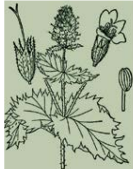
Peppermint - Mentha piperita

Peppermint is a well-known remedy for helping reduce nausea, vomiting, indigestion, bloating and symptoms of irritable bowel syndrome. Peppermint relieves gut cramping and gently stimulates digestive secretions. Several studies have shown oil of peppermint to have a substantial spasmolytic (spasm stopping) effect on the smooth muscles of the gastrointestinal tract.