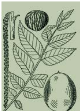
Black Walnut Hulls - Juglans nigra

Black Walnut is used in herbal medicine as an astringent healer, laxative and a vermifuge (kills worms). It is used to expel tapeworms and other internal and external parasites. The American Medical Ethnobotany Reference Dictionary claims that the juice from black walnut hull is effective against ringworm. Black walnut's anti-parasitic properties make it a perfect ingredient in your DETOX program.