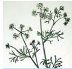
Cilantro - Coriandrum sativum

Commonly known as coriander, Chinese parsley, or cilantro in North America. It has been scientifically shown to protect against heavy (toxic) metals such as mercury, lead and aluminium. It assists heavy metal elimination by chelating, or binding to, these toxic metals, suppressing deposition and helping remove them from your body.