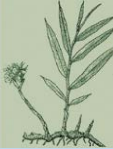
Ginger - Zingiber officinale