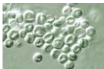
Chlorella - Chlorella Vulgaris