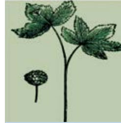
Goldenseal - Hydrastis canadensis

The bitter and antiseptic properties of goldenseal make it a valuable medicinal herb. It is known for its liver stimulant, digestive antiseptic and tonic properties. It helps protect and nourish the entire digestive system and reduces bacterial, fungal and microbial infestation of the gut. It is one of my all time favorite herbs and an important addition to the DETOX program.