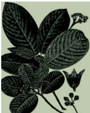
Cascara - Rhamnus purshiana