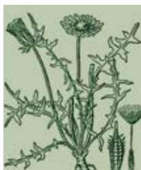
Dandelion - Taraxacum officinale

This fresh-water single celled algae contains Vitamins B1, B2, B3, B6, B12, C, D, E and K, folic acid, beta carotene, luteins, minerals, amino acids, S.O.D, soluble fiber and is very high in chlorophyll. It binds strongly to mercury and other heavy metals for elimination.