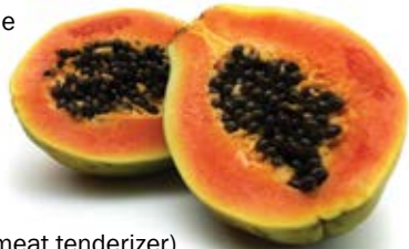
Papaya - Carica papaya

Papaya contains digestive enzymes in the form of at least four cysteine endopeptidases and other constituents including hydrolase inhibitors and lipase, which are widely used in pharmacy. Papaya also contains Papain (commonly used in the food industry as a meat tenderizer)