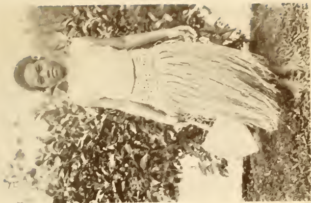
Dressed up in her big sister's dancing skirt