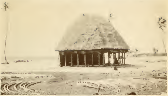
The "House to meet the Stranger"