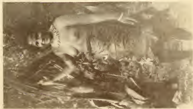
In the bark cloth costume of long ago