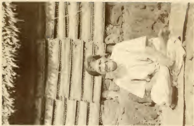
A famous maker of bark cloth