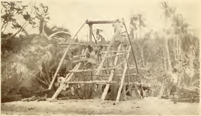
Rebuilding the village after a hurricane