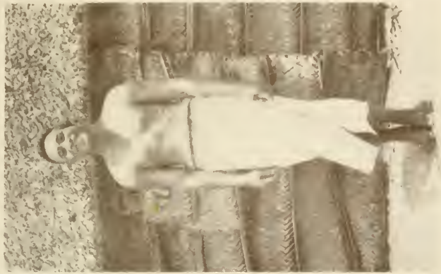
By name, "House of Midnight Darkness"