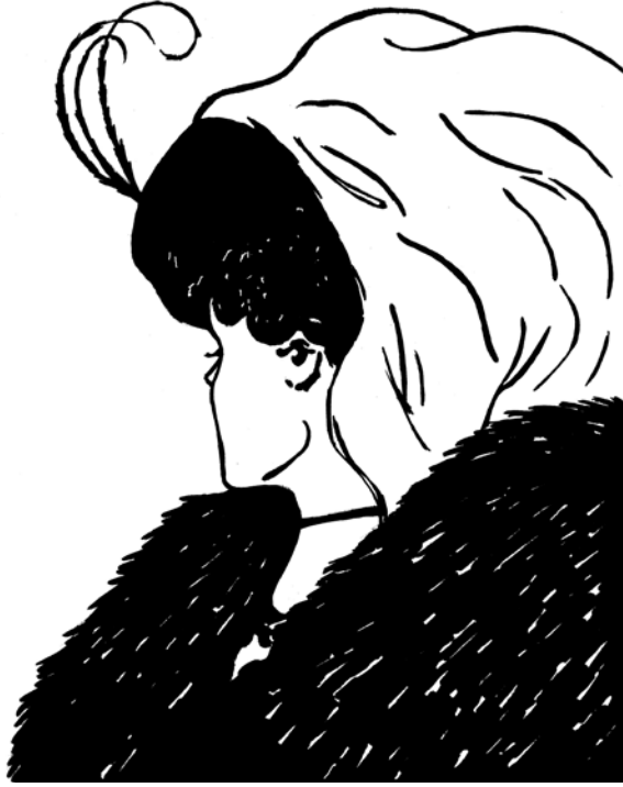
Figure 2: Old Lady or Young Girl?

We see above a famous perceptual illusion in which the brain switches between seeing a young girl and an old woman. An anonymous German postcard from 1888 depicted the image in its earliest known form, and a rendition on an advertisement for the Anchor Buggy Company from 1890 provided another early example.