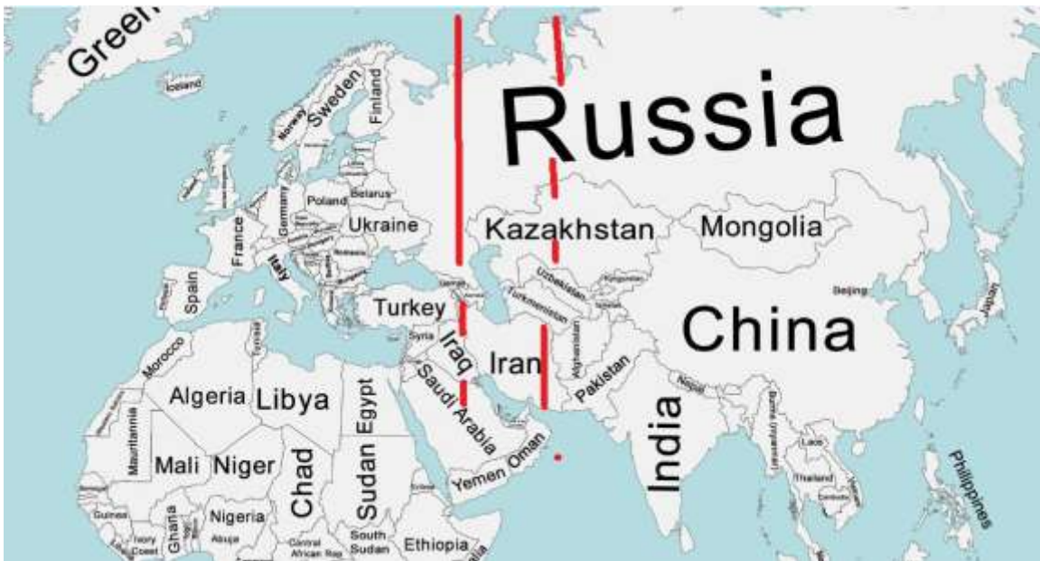
Map 1 The Axis of Oil and Natural Gas

It is always easier for socialist and Islamist dictators to rise to power in countries that are rich in resources. They simply have to promise everything to everyone and people will like them and they will give them power. It is the same story in Saudi Arabia, Iran, the Soviet Union etc. See Wikipedia “Resource Curse”.