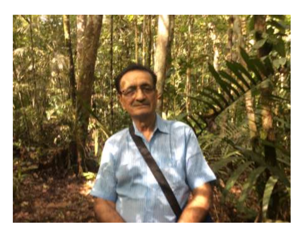
Visiting The Amazon Jungle.