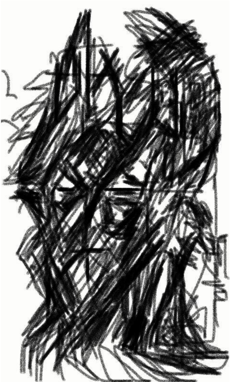
A Demon Called Rael