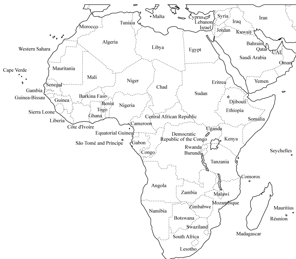
Figure 1.1: Africa

This area extends from far west Africa across the Sudanic plain as far east as the Lake Chad environs, then down to the equatorial district as well as central, east and south Africa and the major islands. This very large spread of land has many and varied peoples and cultures, but historical material is still relatively meager for most of it and from the standpoint of manuscript space, it seems best to consider it under one section.