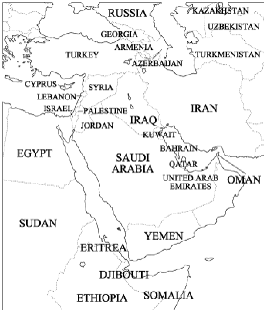
Figure 1.2: The Near East (This map was obtained from http://english.freemap.jp/index.html 4 and is used with permission under a Creative Commons Attribution 3.0 license 5 .)