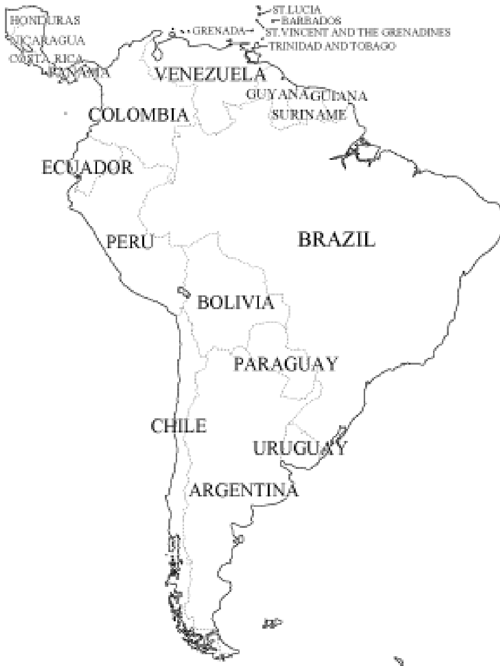
Figure 1.10: Mexico, Central America, the Caribbean, and South America (This map was obtained from http://english.freemap.jp/index.html 22 and is used with permission under a Creative Commons Attribution 3.0 license 23 .)